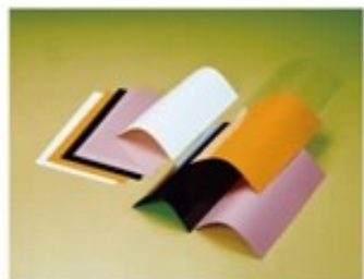
PLA Sheets (Semi-finished products)