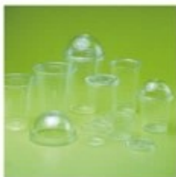
PLA Finished Products